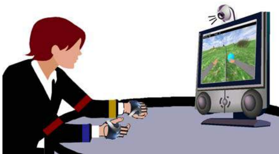
Figure 1 The Rehabilitation Gaming System. The subject faces a screen; on the display, two virtual arms mimic the movements of the user's arms that are tracked by means of a vision based motion capture system. Data gloves are used to capture finger movement.

The system integrates different elements. For the development of the virtual scenarios we used the Torque Gaming Engine ( www.garagegames.com ), which is versatile allowing easy adaptation to other rehabilitation scenarios. To capture arm movements, a vision based motion capture system (AnTS) detects color patches located in specific points of the real arms, i.e., wrist and elbow (Figure 1). For this application, the joint angles of both arms are computed from the position of the tracked patches. The computation of 8 joint angles from a single camera requires a perspective correction system plus a physical model of a skeleton in order to prevent the motion capture system to deliver unrealistic joint angles.