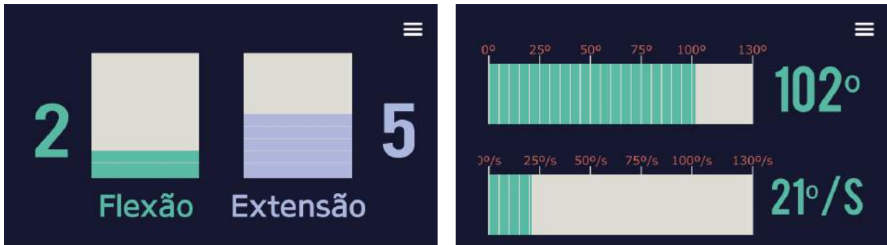
Figure 1. Knowledge of performance mobile assistance. The mobile application can provide a physiologically based feedback (left panel), and a kinematic based feedback (right panel) based on muscular activation or movement kinematic data respectively. ‘Flexão’ and ‘Extensão’ on the right panel is Portuguese for ‘Flexion’ and ‘Extension’ respectively.

stroke survivors with appropriate KP to assist and improve their rehabilitation process. The Android application has been developed with Unity 3D (Unity Technologies, San Francisco, USA) using C# as the main programming language and Java for a custom Bluetooth JAR library through the Android SDK since Unity 3D does not allow direct access to the Bluetooth capabilities of Android devices. With this plug-in we were able to connect to the mPower 1000 device for bi-directional communication.