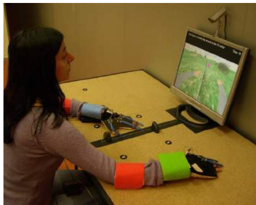
Figure 1. The Rehabilitation Gaming System. A subject sits in a chair with her arms on a table, facing a screen; on the display two virtual arms mimic the movements of the subject’s arms. Arm movements are tracked by the camera mounted on top of the display. The tracking system determines in real-time the position of the color patches and maps these onto a biomechanical model of upper extremities. Data gloves are used to detect finger movements. The markers on the table top are used for calibration tasks.