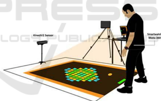
Figure 1: Exercise videogame developed to test the physiological adaptation based on real-time measurements of HR. Adapted from (Muñoz et al., 2016).

HR-adaptive Training: To create a physiologically adaptive system based on real-time HR measurements, we developed a customizable Exergame. Our Exergame is an adaptation of the classic 2D pong, which challenges players to hit a ball using a virtual paddle. Our implementation uses a floor-projection setup that encourages players to perform lateral movements to reach the ball and destroy small blocks to earn points. The tracking of movements is achieved through the Kinect V2 sensor and represented in the Exergame with a virtual paddle. The setup is illustrated in figure 1.