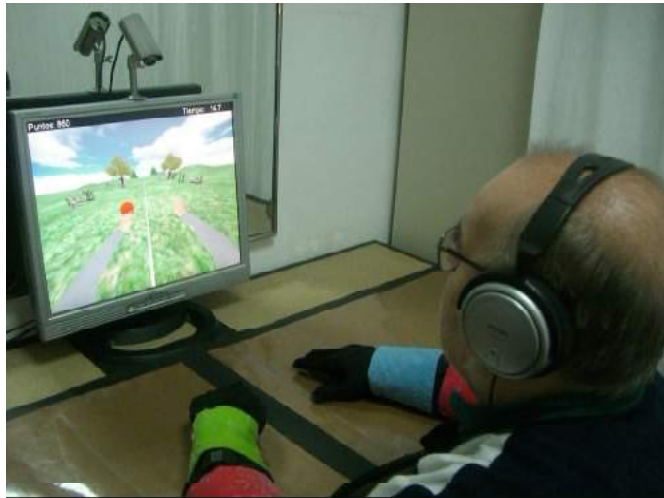
Figure 1. The Rehabilitation Gaming System. A subject faces a display with the arms resting on a table. The arm movements are tracked by a camera positioned on top of the display. The tracking system detects in real-time the position of the color patches located on the wrists and elbows. Data gloves are used to detect finger movements. This way, on the display two virtual arms reproduce the movements of the subject’s arms.

The task is always preceded by an evaluation phase that allows measuring the reaching distance, precision and speed of arm movements in real and virtual worlds (Cameirao, Bermudez i Badia, Zimmerli et al., 2007). First, the subject is asked to touch a sequence of targets marked on the table surface in a specific order. Second, the subject is asked to perform the same task in the virtual world using the virtual arms and a virtual replica of the table with the targets.